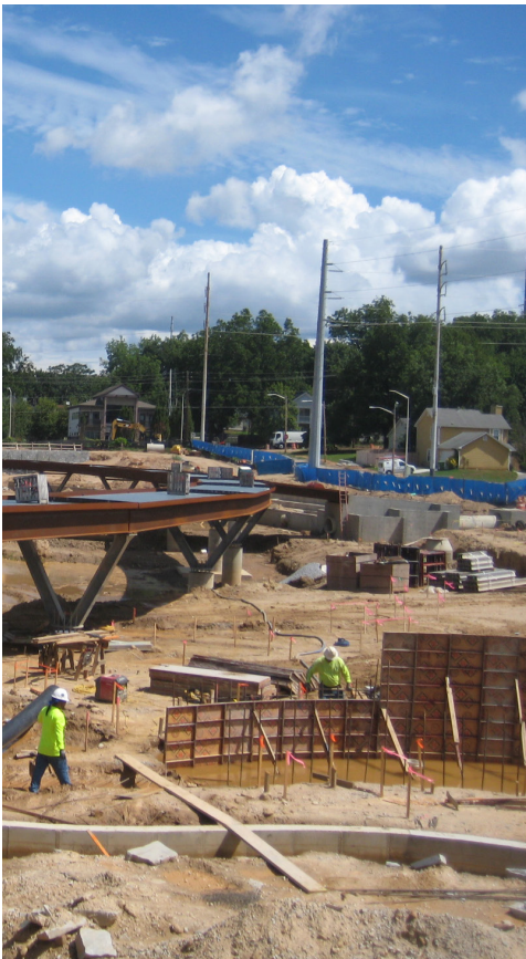
Major Water/Wastewater Project Locations