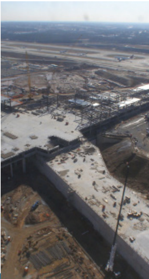
Major Aviation Project Locations